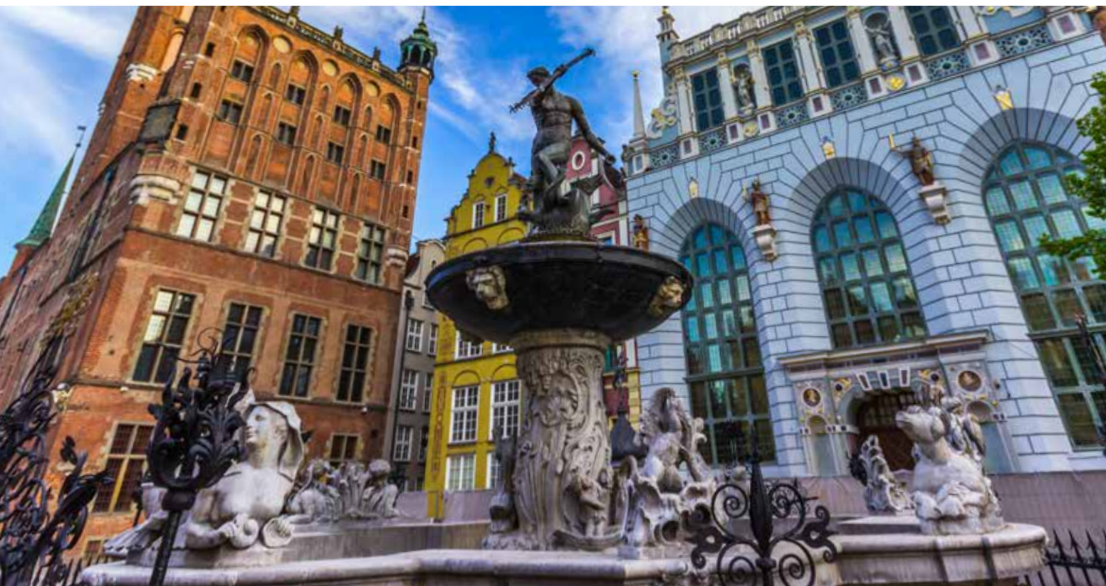
Neptune's fountain in Gdańsk

Scale and size of an investment are not a problem for us. We undertake the realization of large and technologically advanced multimedia systems and smaller water objects, as well as modernization of classical fountains, with equal enthusiasm.