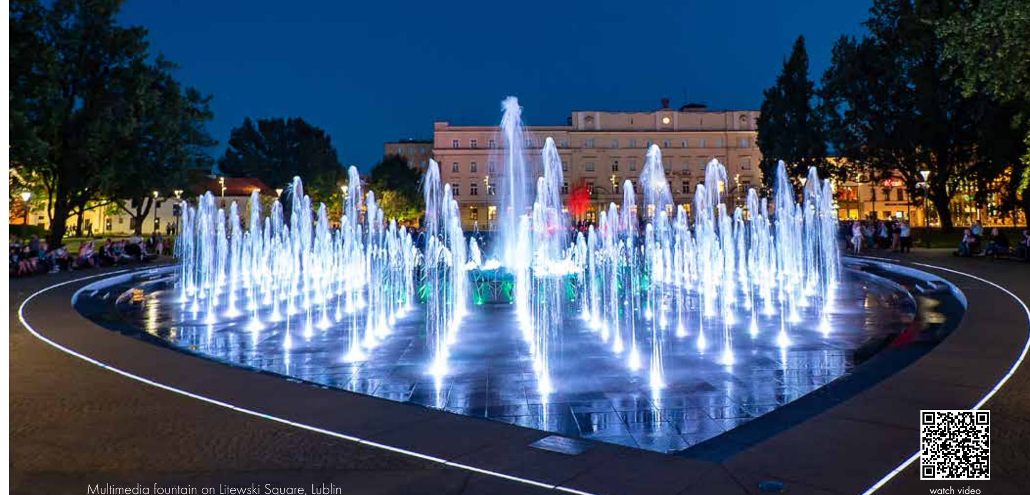
Multimedia fountain on Litewski Square, Lublin

We offer modern and innovative water systems, which create a unique atmosphere and provide unforgettable experiences and are also important and distinguishing features of public spaces, often becoming a symbol of them.