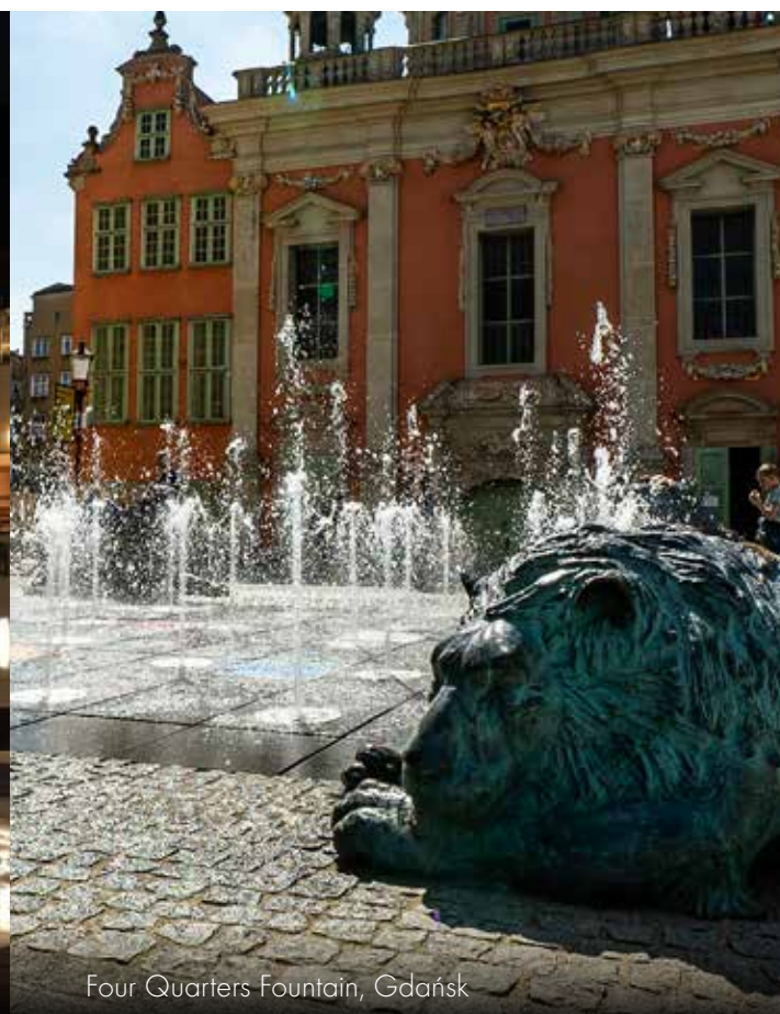
Four Quarters Fountain, Gdańsk