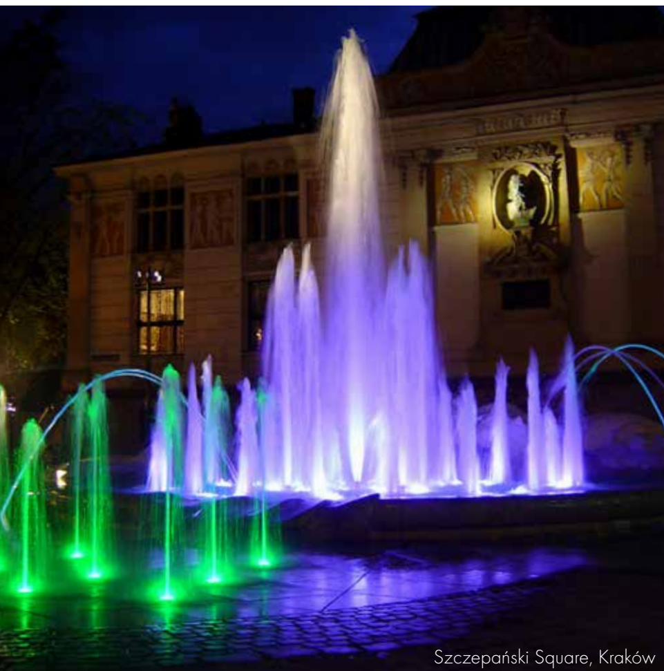
Szczepański Square, Kraków