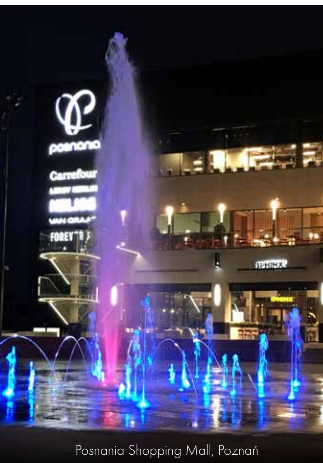
Posnania Shopping Mall, Poznań

Our projects bring splendor to markets, squares, parks and other representative locations in many towns and cities, and provide shopping centers and malls with an inimitable character.