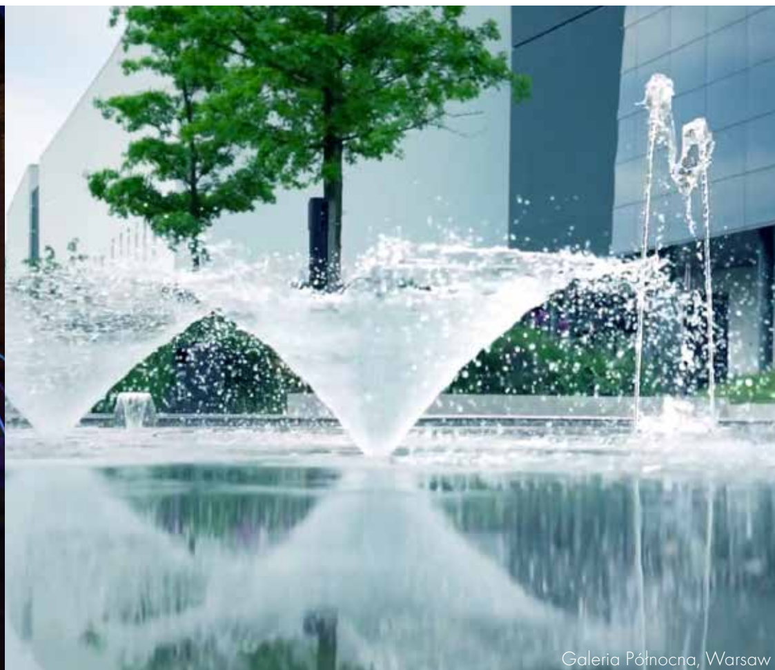
Galeria Północna, Warsaw

We offer modern and innovative water systems, which create a unique atmosphere and provide unforgettable experiences and are also important and distinguishing features of public spaces, often becoming a symbol of them.