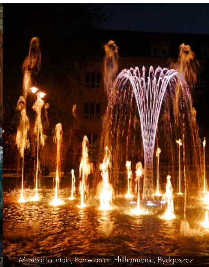
Musical fountain, Pomeranian Philharmonic, Bydgoszcz